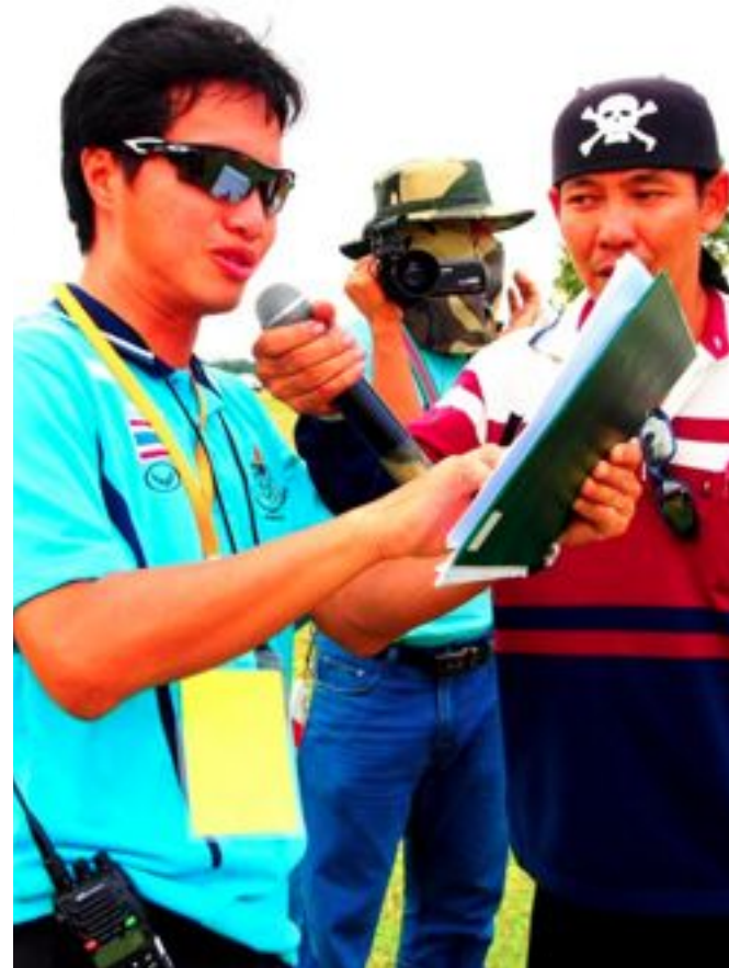
Nayot Comp Director