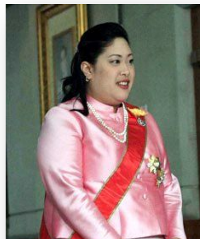
HRH Princess Siribha Chudhabhorn RASAT President

“Flying sports everyone can access and enjoy”